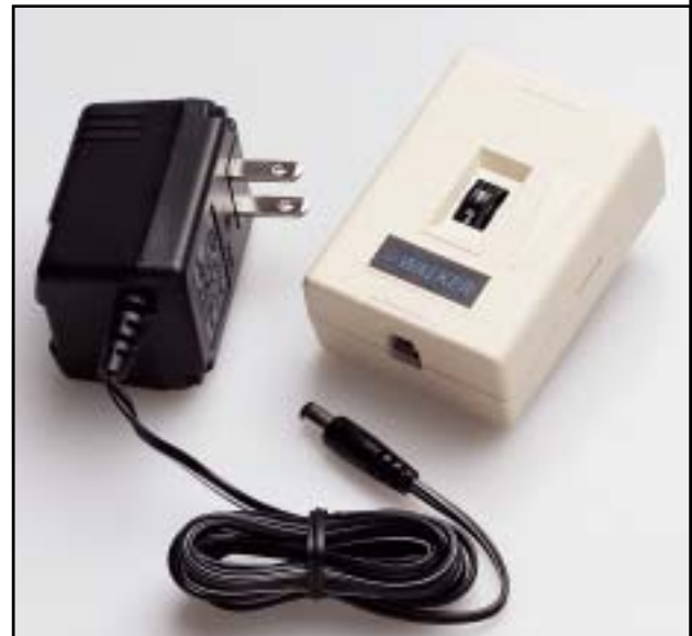
Amplifier shown: W10

The W10 series boost the receiver volume over three times the normal level, making hard-to-hear calls easier to hear.