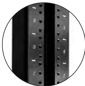
Rack-Mount Unit (U) marks simplify equipment installation