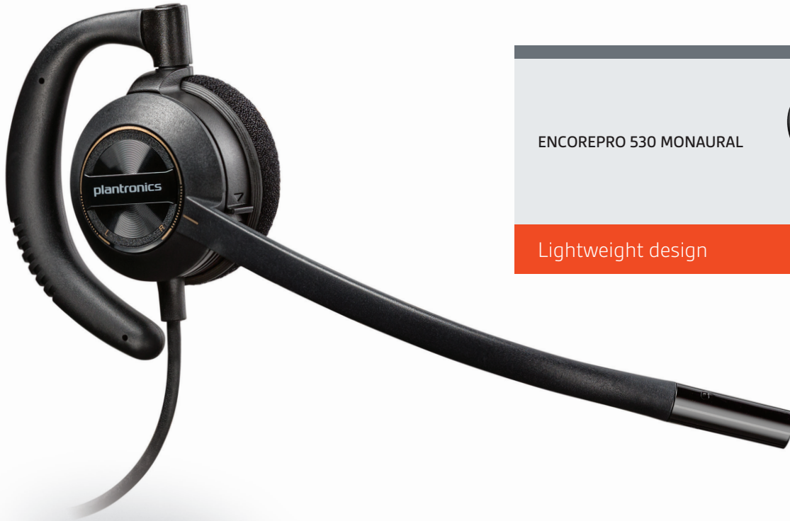
ENCOREPRO 530 MONAURAL

With wideband audio designed in from the start and a custom noise-canceling microphone on a flexible boom with positioning guide marks, you and your customers are set for a best-in-class experience.