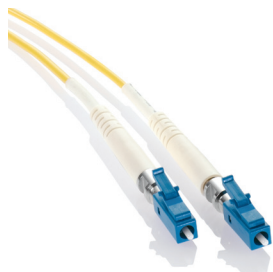
UPC LC-LC Simplex SM