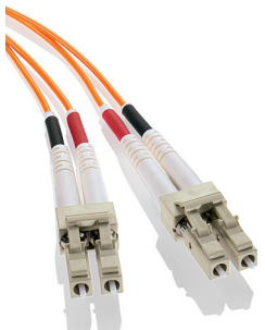
LC-LC Duplex, 62.5/125 MM

Fiber Optic Patch Cords are designed to interconnect or cross connect fiber networks within structured cabling systems. Typical fiber connector interfaces are SC, ST, FC, LC, MT-RJ, and LC in either multimode or single-mode applications.