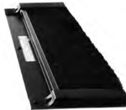
Extended Brush Raised Floor Grommet*, 2 Sizes For Large Cable Openings