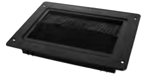
Integral Raised Floor Grommet*, 2 Styles For New Installations