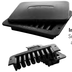
KoldLok Wave™ Split Integral Grommet and Cover Seals space around cables with a solid, flexible wave shaped thermoplastic elastomer material.