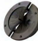
4" (100 mm) Round Grommet For Small Cable Bundles