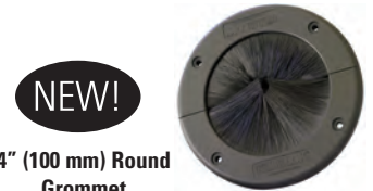
NEW! 4" (100 mm) Round Grommet For Small Cable Bundles

Unsealed cable openings in access floor environments allow valuable conditioned air to bypass equipment. Bypass airflow contributes to hot spots, cooling unit inefficiencies and increased infrastructure costs. To reduce bypass airflow and improve data center cooling, block unsealed cable holes with KoldLok® Raised Floor Grommets.