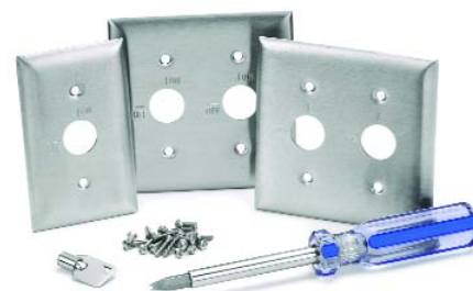
Wall Plates and Accessories