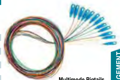
Multimode Pigtails Available!