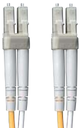
LC Duplex to LC Duplex MM