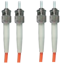
ST to ST-style Duplex MM