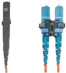
MT-RJ Duplex to SC Duplex MM