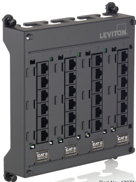
Part No. 476TM-624

Leviton's six Twist & Mount Patch Panels are designed for use in any of Leviton's existing Structured Media® Centers to support a variety of telephone and data distribution needs. These panels hold patching modules, which allow 12 or 24 ports of patching capability to CAT 5e or CAT 6 cabling. The CAT 5e ports meet the requirements of high-speed data applications, and the CAT 6 ports are designed for use in high megabit applications such as Gigabit Ethernet.