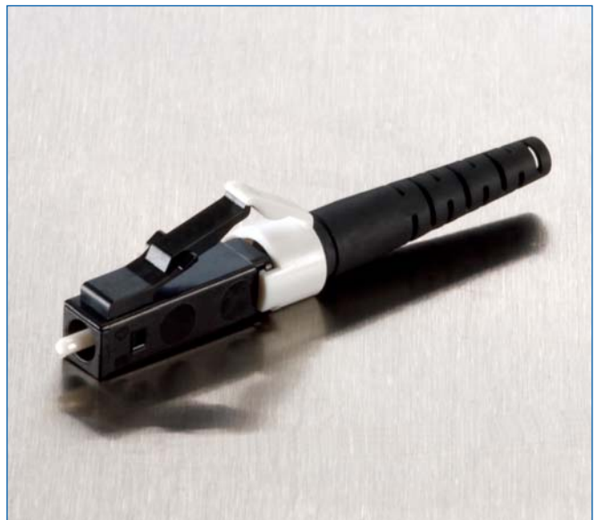
Heat-Cure LC Connector | Photo LAN751