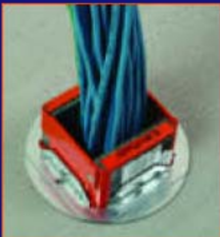
EZ-Path™ Floor Installation

EZ-Path™ eliminates these problems. From installation (empty) to 100% visual fill it remains fire and smoke compliant... 100% of the time.