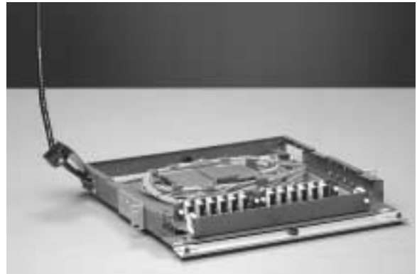
PCH-01U with Cover Off | Photo LAN401