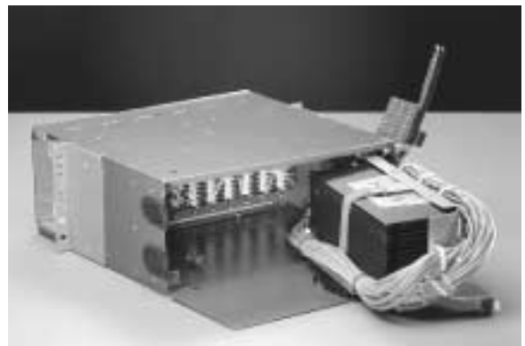
PCH-04U with Splice Option | Photo LAN398