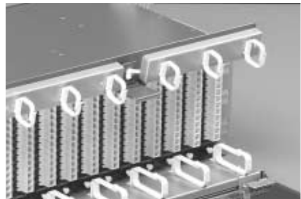
Close-up of PCH-04U Integrated Jumper Manager | Photo LAN407