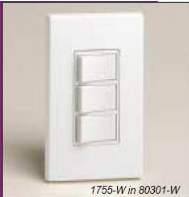
1755-W in 80301-W