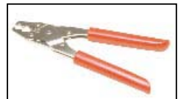
CT 770 Economy Hex for RG-6 and RG-59