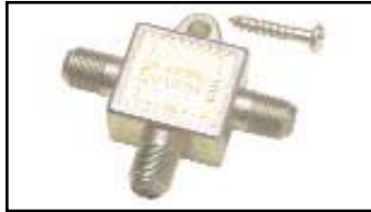
CT 411 2 way "MINI" 3.5 DB insertion loss 20 DB isolation, DC passive