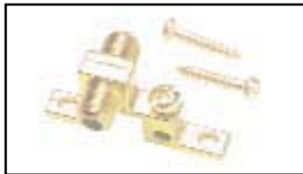
CT 722 Die Cast/Mounting Block w/screws (2 pkg)