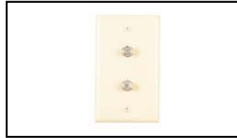
CT 102FF-XX (Plastic) Duplex, E/W Two F-81 fittings (09)-Ivory, (15)-White