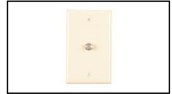
CT 103F-XX (Plastic) E/W F-81 3/4" fitting (09)-Ivory, (15)-White