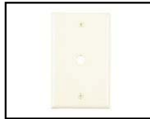
CT 103 CT 103-XX (Plastic) w/3/8" Hole for F-Connectors (09)-Ivory, (15)-White