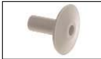
CT 240 -for RG-59 Cable CT 241 -for RG-6 Cable (100 pkg)