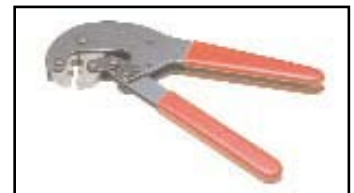
CT 771 Deluxe Hex for RG-6 and RG-59