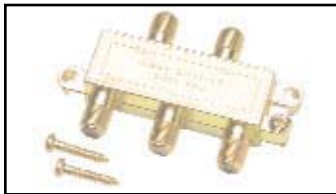
CT 414 4 way 6.5 DB insertion loss 30 DB isolation, DC passive