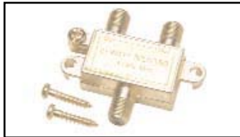
CT 412 2 way 3.5 DB insertion loss, 20 DB isolation, DB passive