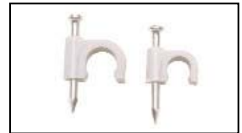
CT 726 -for RG-59 Cable CT 727 -for RG-6 Cable (100 pkg)