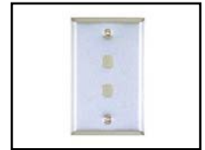
CT 104F-XX ATBK-CX-2 ATBK-CX/ATBK-CX-2 For 1 or 2 Coax Connectors .500: Holes, Stainless Steel ATBK-F/ATBK-F-2 For 1 or 2 F-type .375: Holes, Stainless Steel