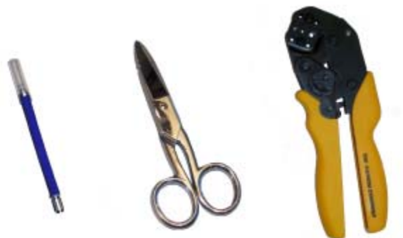
FT-SCRIBE CI-SCISSORS FT-CRIMP