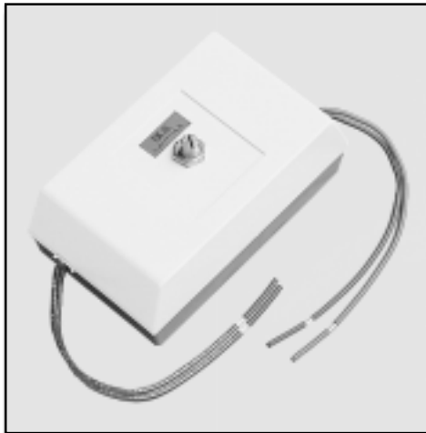
BA-1 or BA-1P