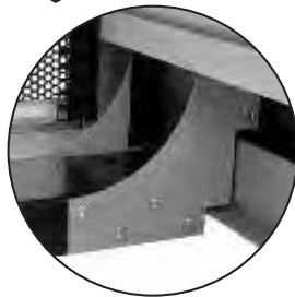
Closeup of reinforced inner frame