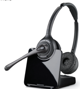
CS520 Over-the-head style