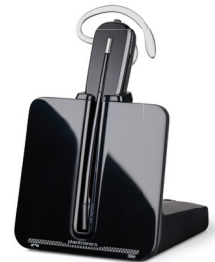
CS540 Convertible style