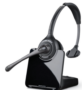
CS510 Over-the-head style

*For details and full program Terms and Conditions, see next page, or visit www.plantronics.com/customeroffer .