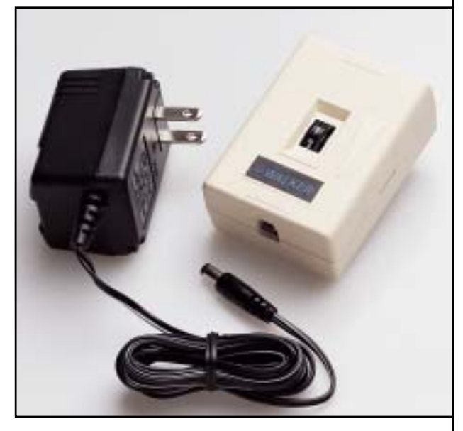
Amplifier shown: W10

The W10 series boost the receiver volume over three times the normal level, making hard-to-hear calls easier to hear.