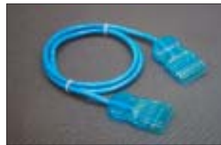
ICPCSR03BL CAT 5