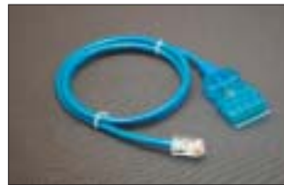
ICPCSA03BL CAT 5