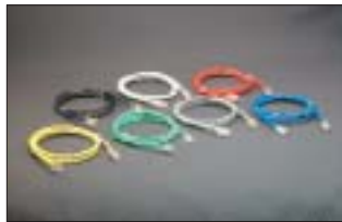
ICPCS503xx* CAT 5