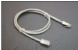
ICPCSS03GY CAT 5 ScTP