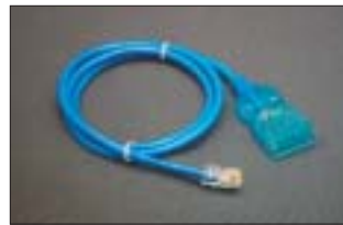
ICPCSB03BL CAT 5