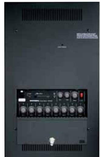
RACK-MOUNTABLE version on Page 38

Technical Specifications, Dimensions, and Weights can be found on Page 79