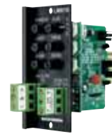
LMR1S with Remote Volume Control