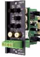
ANS1R with Sensor Microphone