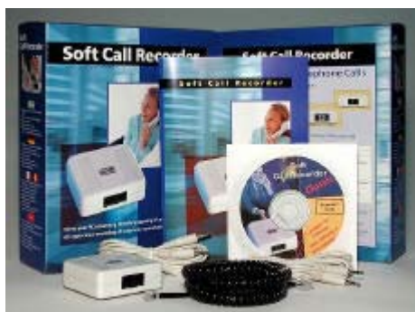
SC-1165 — Soft Call Recorder Package