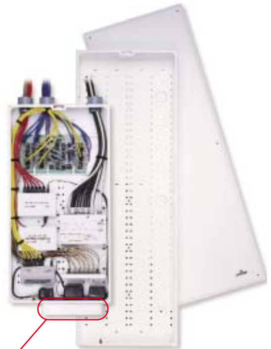
Surge-protected AC power module shown in Structured Media Center series 280.