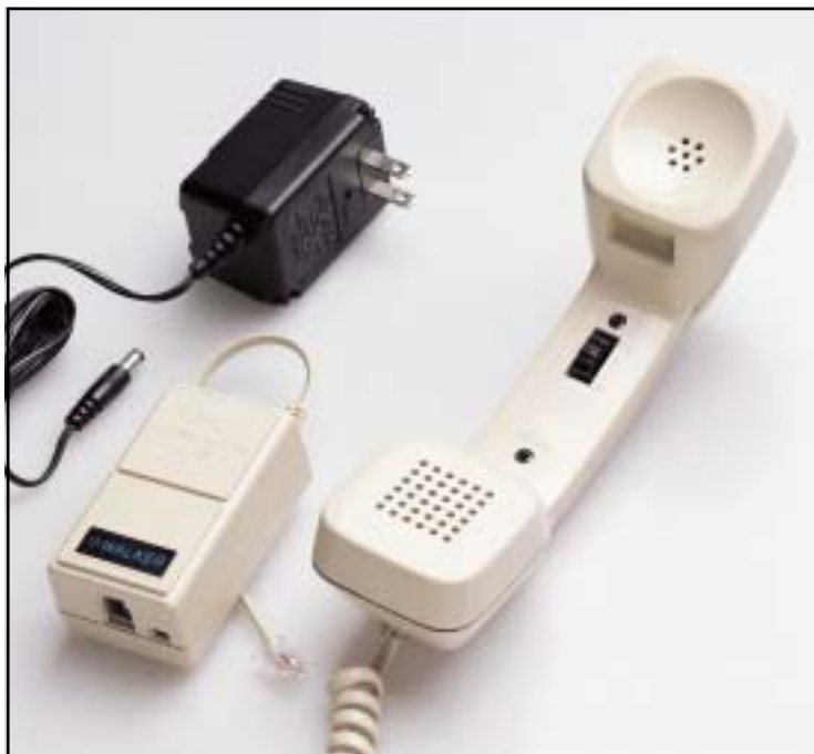
Handset shown: W6-UNI-K

The W6B is only available in K-style. The W6-UNI G-style is available by special order only. Both units are available with noise canceling. Hearing aid compatible.