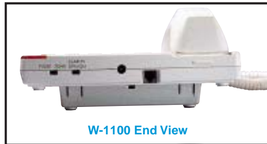
W-1100 End View