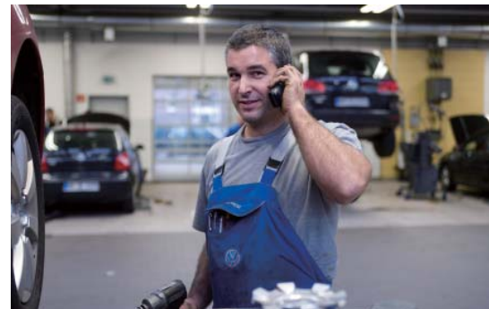
Incoming signal automatically adjusts according to ambient noise level for maximum clarity.

Panasonic leads the industry for noise reduction technology that smooths communication in a loud environment. The KX-UDT Series employs technology that estimates and subtracts the noise component from the input signal to deliver best-in-class voice quality.