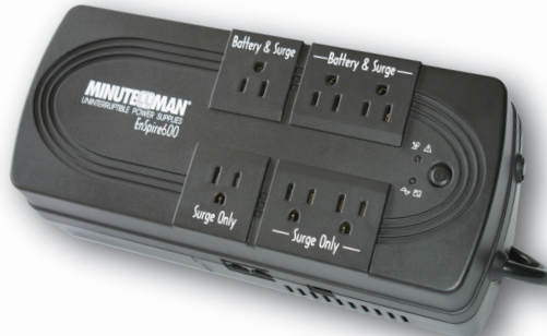
EnSpire EN600 - 600VA/300W Standby UPS

The Minuteman® EnSpire™ Series UPS is an exciting new UPS line that provides the features needed to protect your valuable equipment in a low-cost product.