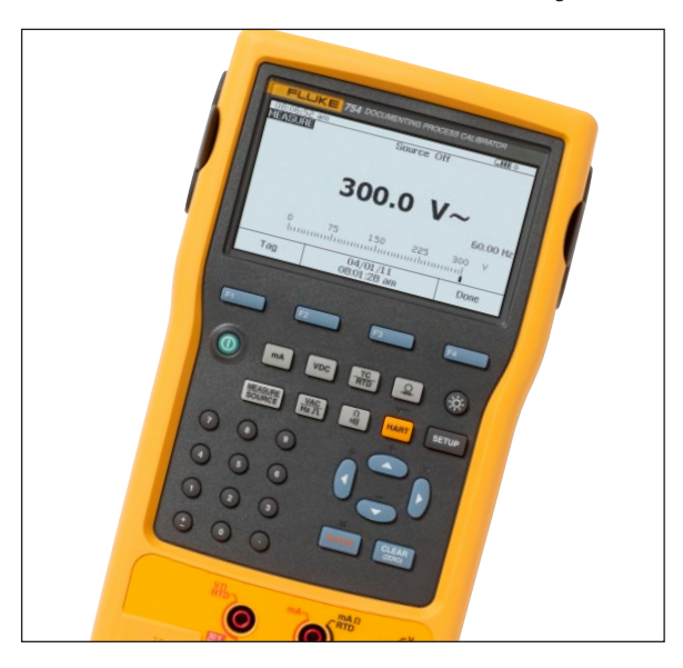
Fluke 754: The HART calibrator that is easy to use.