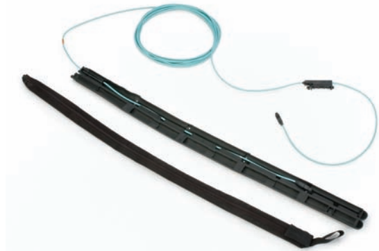
Plug & Play Universal Systems Extender Trunk | Photo LAN798

Plug & Play Universal Systems extender trunks are used to distribute portions or all of the fibers in a Plug & Play Universal Systems trunk to other areas in the infrastructure. For example, a high-fiber-count trunk can be deployed from a main distribution area to zone distribution area. Smaller-fiber-count extender trunks can then be utilized to distribute fiber into cabinets. Extender trunks are manufactured with pinned MTP® Connectors on one end of the cable trunk and non-pinned MTP Connectors on the other end. The pinned MTP Connectors mate with the non-pinned connectors of the Plug & Play Universal Systems trunk and the non-pinned MTP Connectors are plugged into the Plug & Play Universal Systems module or Plug & Play Universal Systems harness.