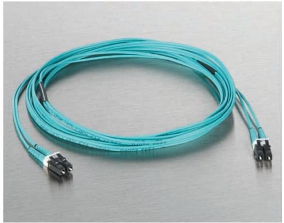
Low-Loss Jumpers and Reference Jumpers | Photo LAN663

Corning Cable Systems' state-of-the-art manufacturing process ensures unsurpassed connector performance. Fibers and ferrules are thoroughly screened at the beginning of the process, assembled and polished in a carefully monitored and controlled process, and quality tested to ensure top performance. This assembly and polishing process ensures the same outstanding quality in every connector. When performance counts, ask for Corning Cable Systems assemblies.