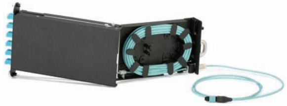
Plug & Play Universal Systems Integrated Trunk Modules, 40 ft (open view) | LAN768

The Plug & Play Universal Systems integrated trunk module is universally wired to manage fiber polarity. Through a patented manufacturing process and innovative design, Plug & Play Universal Systems avoids the polarity problems caused by incorrect placement of modules and jumpers. This preterminated, polarity-managed solution dramatically streamlines the process of deploying an optical networking infrastructure, significantly reducing installation time and cost.