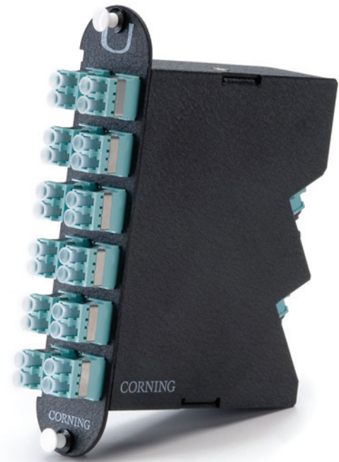
Plug & Play Universal Systems Module | Photo LAN804

Using modules provides adaptability for the changing data center environment, which requires technology evolution every 12 to 18 months. The use of Plug & Play Universal Systems CCH modules in the data center offers the advantage of greater manageability. They can easily be swapped with new CCH modules when future connector requirements change, leaving the existing trunk cable structure in place.