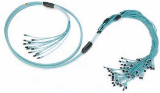
Plug & Play Universal Systems Hybrid Connector Trunk | Photo LAN801

Universal hybrid connector trunks are terminated with MTP® Connectors on one end of the trunk and LC connectors on the other end for applications requiring one end of the trunk to connect directly into system equipment or patch panels. Both Plug & Play Universal Systems trunks and extender trunks are available in hybrid connector options.