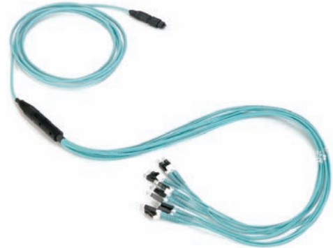
Plug & Play Universal Systems Harness Assembly | Photo LAN802

Corning Cable Systems Plug & Play Universal Systems harness assemblies are targeted for data center and high-fiber-count telecommunications systems where there is no room to mount interconnect hardware into racks or cabinets, or pathway space is limited. The 2.0 mm legs for single-fiber connectors provide a more rugged solution than products with 900 µm legs. Used with the Plug & Play Universal Systems trunks or extender trunks, they provide quick installation in applications where up-jacketed legs are needed for direct installation into electronic equipment. They provide a routing solution that is less dense than traditional jumpers since the MIC® 250 Cable end of the harness that routes through the rack or cabinet is much smaller than the equivalent six 2-fiber patch cords.