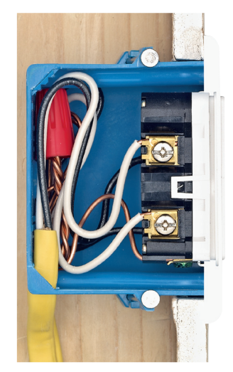
New SmartlockPro Slim GFCI