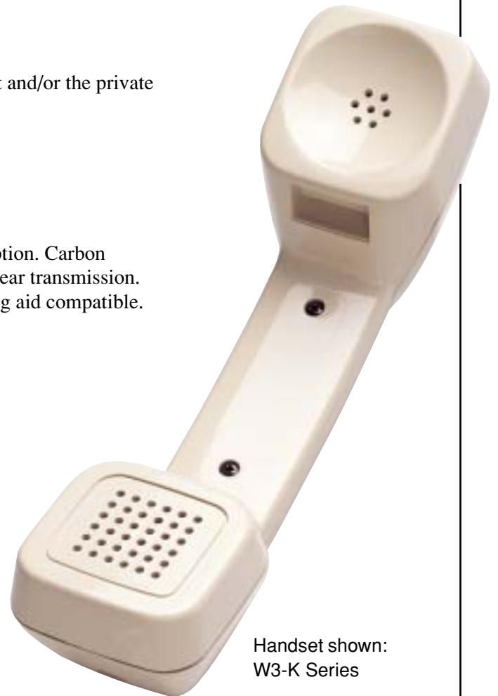
Handset shown: W3-K Series

Standard receiver provides clear, static-free sound reception. Carbon compatible, Electret or Dynamic transmitter for extra clear transmission. Noise canceling available as an optional feature. Hearing aid compatible.