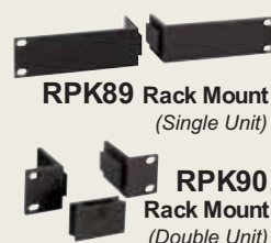
RPK89 Rack Mount (Single Unit)