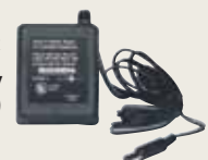
PRS40C Power Supply (12V DC)