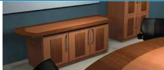
Using the New C5 Millwork Kit lets a custom millworker provide matching outer surfaces. (Not a standard offering)