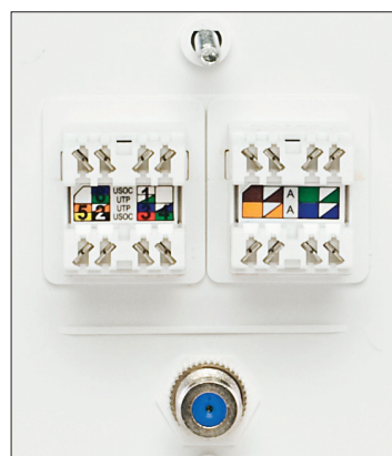
Back of plate, 5EA20-S3W