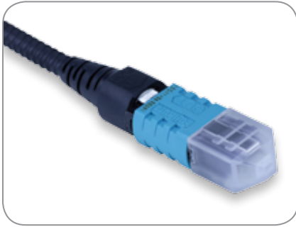
FuseConnect MPO Connectors, Cable