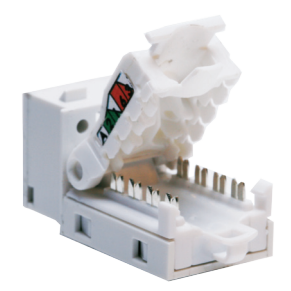
5ETLS-R*5 (rear view)

The HOME 5e Tool-Free Connector is designed to be used with all Leviton QuickPort® products. The connector supports high megabit applications such as Gigabit Ethernet. The connector features fast tool-free termination in residential applications.