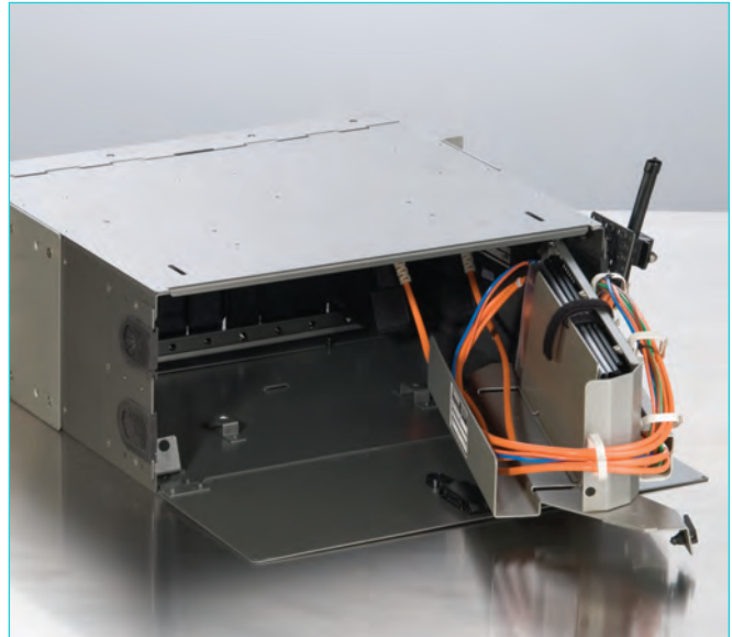
PCH-04U with Splice Option | Photo LAN738

The units include the universal cable clamp for cable strain-relief and optional splicing accessories are available. The housings have rugged metal construction and are shipped with everything needed for installation.