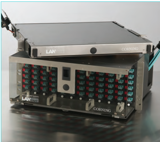
PCH-01U and PCH-04U Housings | Photo LAN585