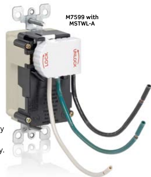
M7599 with MSTWL-A