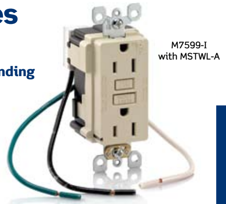
M7599-I with MSTWL-A

In accordance with the NEC, these devices are suitable for use in all 15 or 20 ampere branch circuits of 125 Volts in commercial and institutional installations where UL 943 Class A(GFCI) and UL 498(Receptacle) standards of mechanical and electrical life are specified.