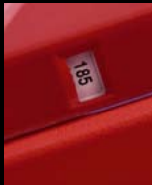
8 candela settings