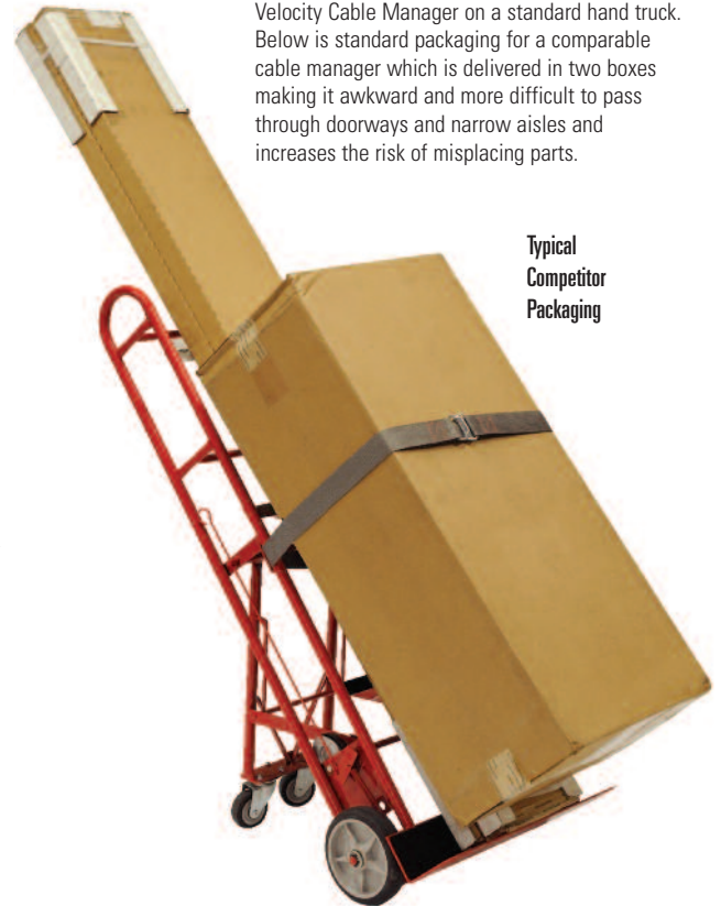
Typical Competitor Packaging

Compact packaging makes it easier to move Velocity through the job site. The photo above is a complete 12 inch wide (305 mm) double-sided Velocity Cable Manager on a standard hand truck. Below is standard packaging for a comparable cable manager which is delivered in two boxes making it awkward and more difficult to pass through doorways and narrow aisles and increases the risk of misplacing parts.