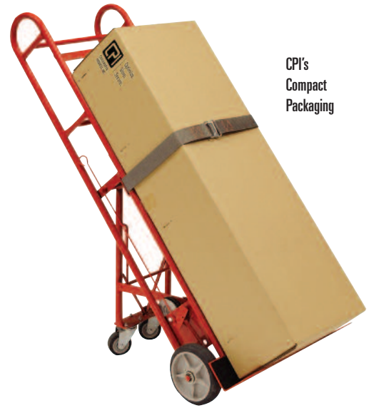
CPI's Compact Packaging

Compact packaging makes it easier to move Velocity through the job site. The photo above is a complete 12 inch wide (305 mm) double-sided Velocity Cable Manager on a standard hand truck. Below is standard packaging for a comparable cable manager which is delivered in two boxes making it awkward and more difficult to pass through doorways and narrow aisles and increases the risk of misplacing parts.