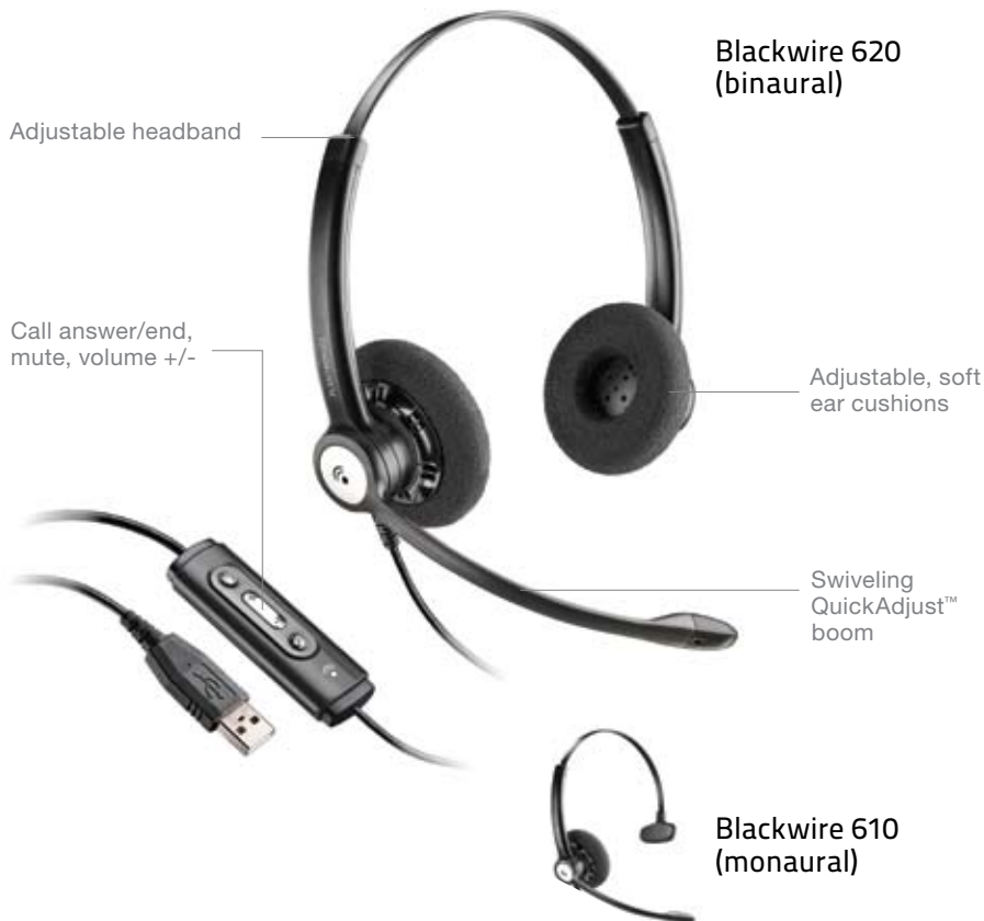
Blackwire 620 (binaural)