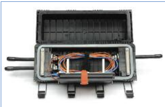
UCA3-6 FITL (with flip tray open) | Photo TRCLS100