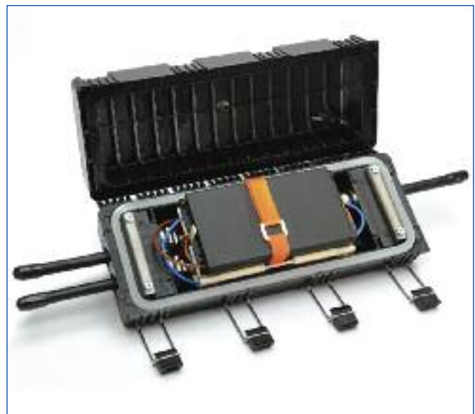
UCA3-6 FITL (with flip tray) | Photo TRCLS101