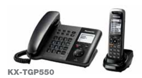
SIP IP Expandable Cordless Phone System with Corded Handset Base Station and 1 Cordless Handset