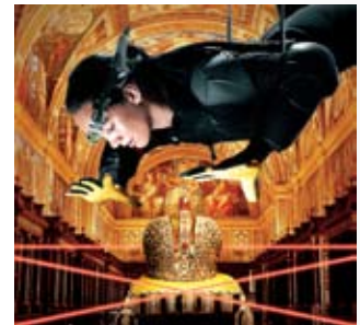
600 TV Lines