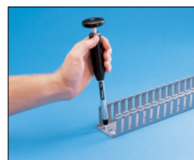
Step 2 — Position rivet into hole.