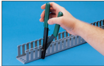
Step 1 — Notch wiring duct sidewall at the desired opening width.

Always use approved safety goggles when using any tools.