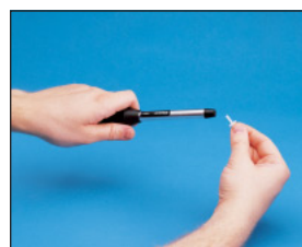
Step 1 — Insert rivet in tool.