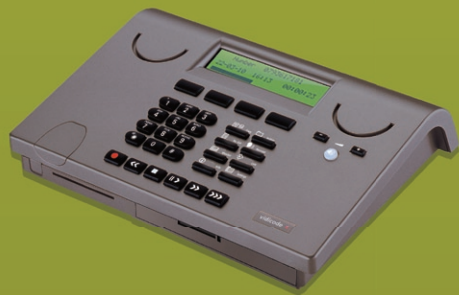
Grey Line Call Recorder Single Digital

The Call Recorder SD2750 is the ideal single channel solution for demanding recording applications on PBX systems like Siemens, Avaya, Philips or other systems using Up0 or ISDN S0 line technology.