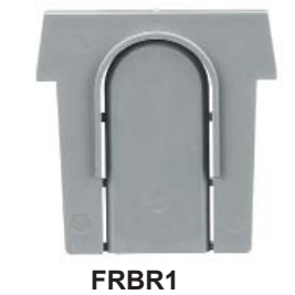
HUBBELL Wiring Device-Kellems