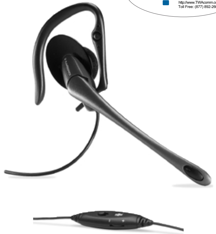
Easy volume and mute control (available on M135)